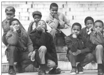
SEE YOU THERE!

This year's celebration will take place at the Eubie Blake National Jazz Institute & Cultural Center in Baltimore City and will include the presentation of the Dr. John T. Chissell Optimal Achiever Award. Festivities will begin with a reception at 2 pm designed to give the nominees, event sponsors and dignitaries an opportunity to meet and network. Tickets are only $30 in advance ($40 at the door). For information about tickets, journal ads or a sponsorship call AGBM at 410-637-5451 or send emails to us at info@agoodblackman.com .